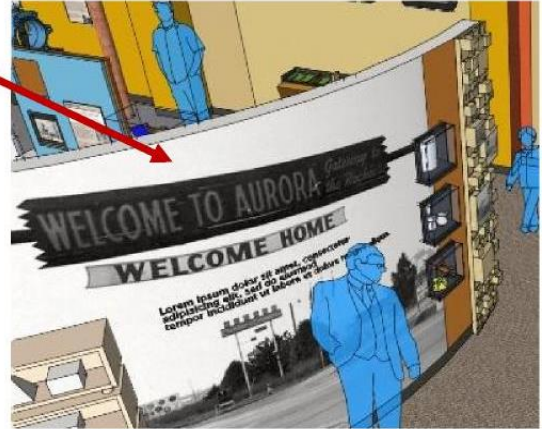
Colfax & Day Chevrolet Full Wall Photo Mural - $5,000